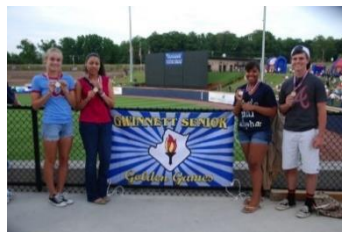
Demo at Gwinnett Braves May 11